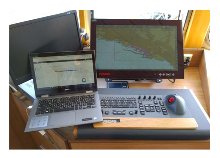
Figure 3 The cyber security testing setup.

The cyber security testing of the ECDIS was performed using the industry most widely used vulnerability scanner, the Nessus Professional version 8.0.1 (Nessus, 2019). The vulnerability scanning is a computational method of detecting cyber vulnerabilities, which are known not only