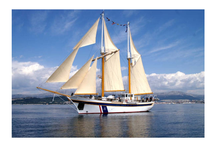
Figure 1 Training and research ship Kraljica mora.